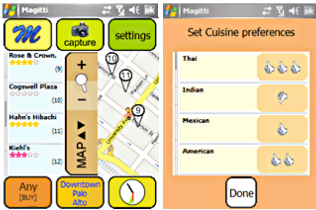
Figure 2. Main screen with map in hybrid view (left), and a preferences screen for rating types of cuisines (right).

Ordinarily, Magitti recommends activities for the current time and place, but the user can plan ahead by specifying a different time and/or location. They can also set a distance range for the recommendations. Finally, users can bookmark items and they can enter a keyword search, requesting the best matches or places that are nearby.